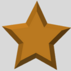
Bronze Award 30-59 hours

You can also work towards the one of our Aber Award certificates which celebrate all student volunteers by recording your volunteering hours and skills.