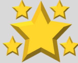
Gold Award 120+ hours

To find out more or register as a volunteer, go to www.abersu.co.uk/teamaber/volunteering